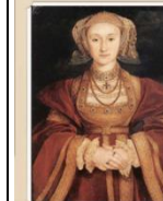
Anne of Cleves