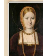
Catherine of Aragon