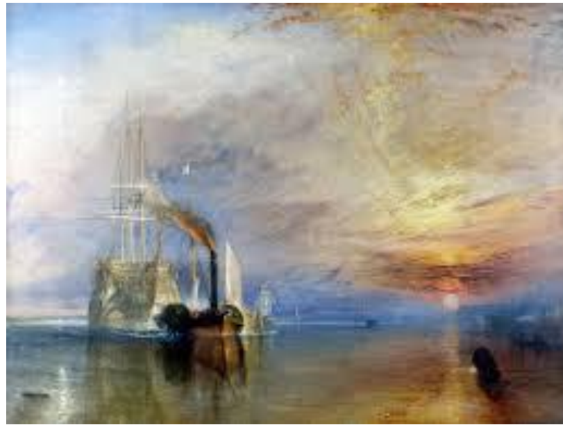
The Fighting Temeraire (1838)