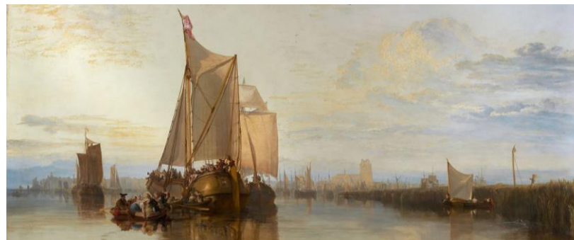
The Dort Packet-Boat (1818)