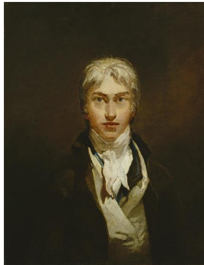
JMW Turner 1775-1851